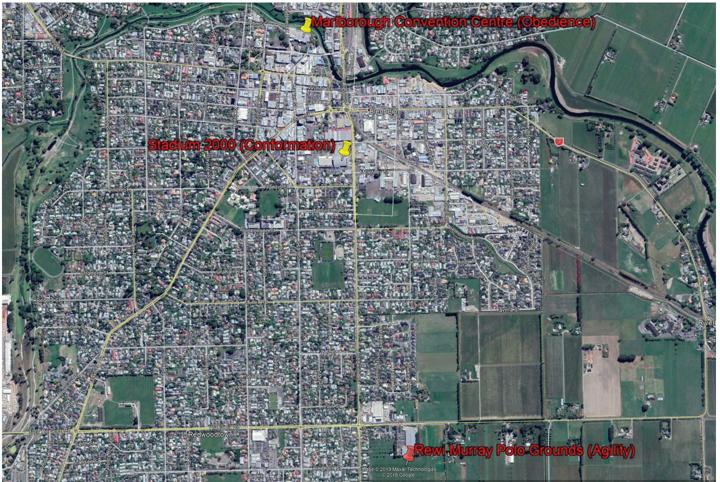
Map of the 3 Black Hawk National Dog Show venues for 2019